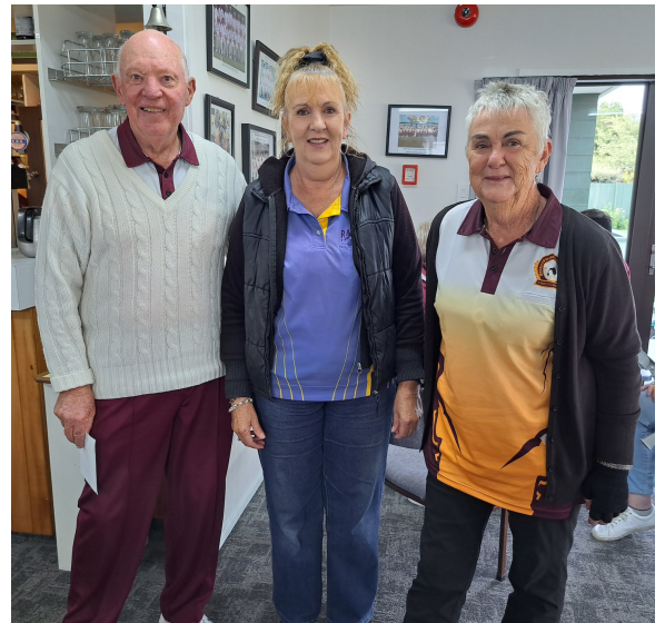
Winners of the monthly Triples tournament held in March.